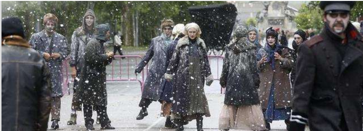
Espectáculo 'Teatro de Silencio'.

25.05.14 - 17:18 - VIRGINIA T. FERNÁNDEZ | VALLADOLID