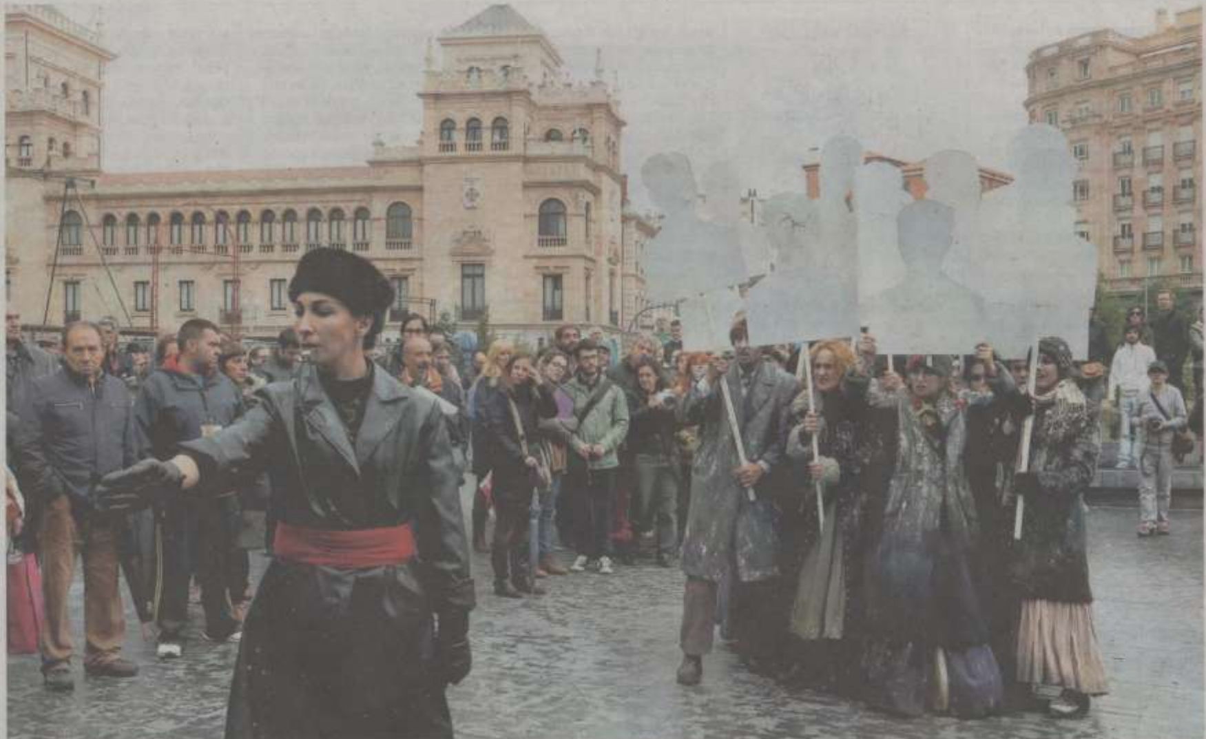
La plaza de Zorrilla parecía ayer la plaza Roja de Moscú en plena revolución gracias a los actores y voluntarios de Teatro del Silencio y su 'Doctor Dapertutto'.