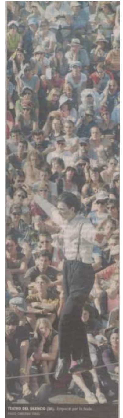
TEATRO DEL SILENCIO (38). Remplissage par la foule.

The second day of the Festival of Street Theatre knew a public's beautiful abundance, as the image of the spectators of the Teatro del Silencio